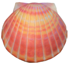
ROSE SEA SHELL